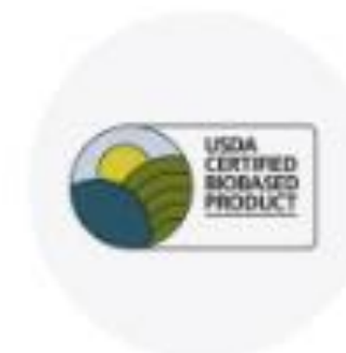
USDA Biobased Product